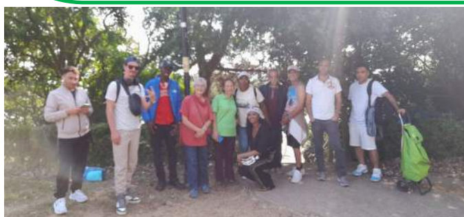
Enjoying the local countryside.