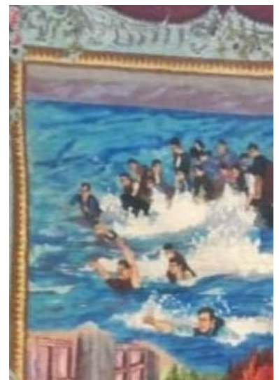
Detail of carpet

The exhibition will remain at Firstsite for a year. Highly recommended!